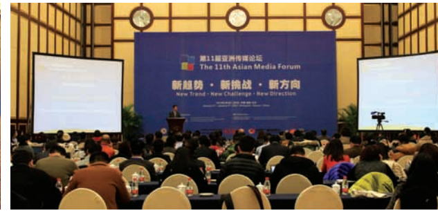
The 11th Asian Media Forum

the Choice of Asia", focusing on economics, finance, trade, energy, and the environment. The first forum was held during the Centen - nial Celebration of Fudan University in 2005.