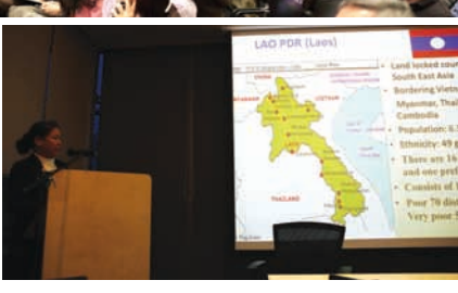
You must throughly discuss each other's role and involve ment in each other's research before entering Korea.