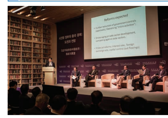
Understanding China Conference