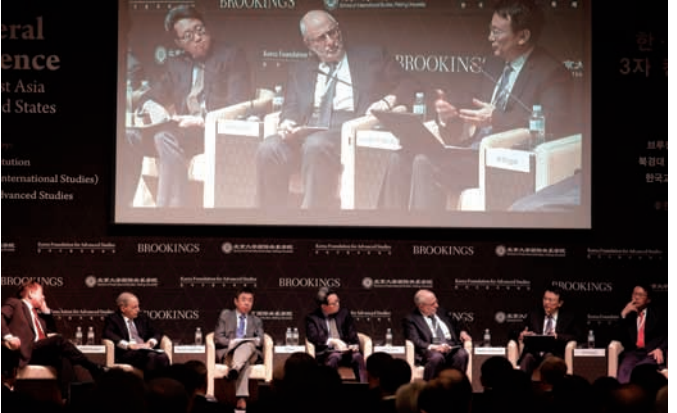
Trilateral Conference on North-East Asia and the United States